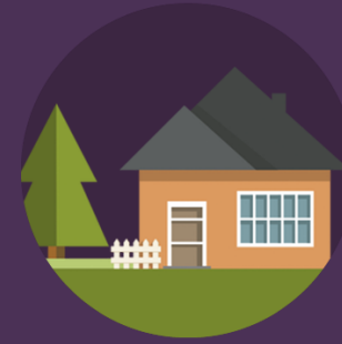
Escape to the Country