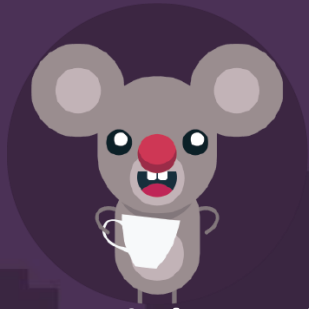
Sweet Little Candy Mugs