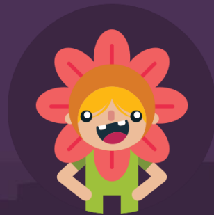
Sociotherapy Through Theatre