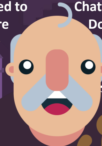
THIS IS ST THE G