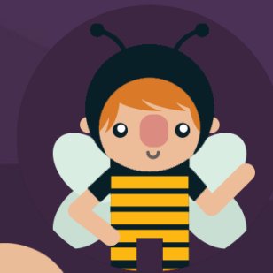
Are Invited to the Theatre