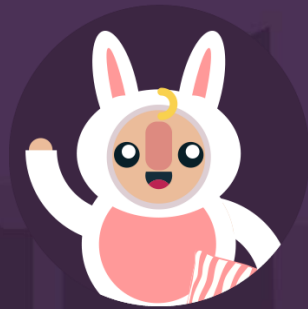
Tiny Pillows for Tiny People