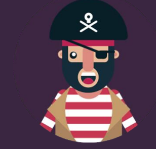
The Month of Fairytale