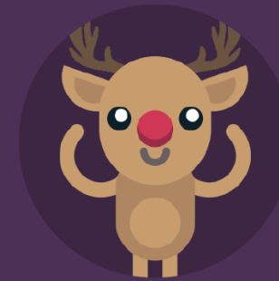
Carnavalul Bradului de Craciun