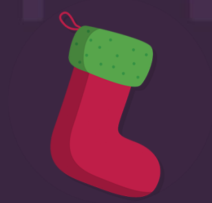
A Stocking Full of Candy