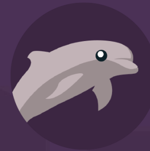
Chatting with Dolphins