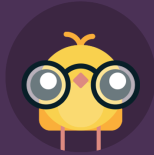
Free Visits to the Optician